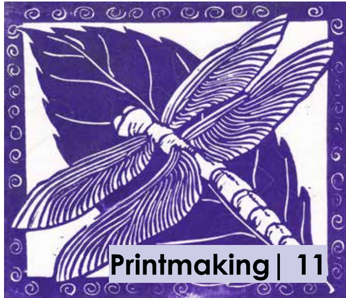
Printmaking | 11