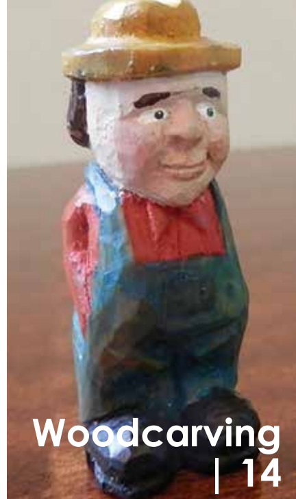
Woodcarving | 14