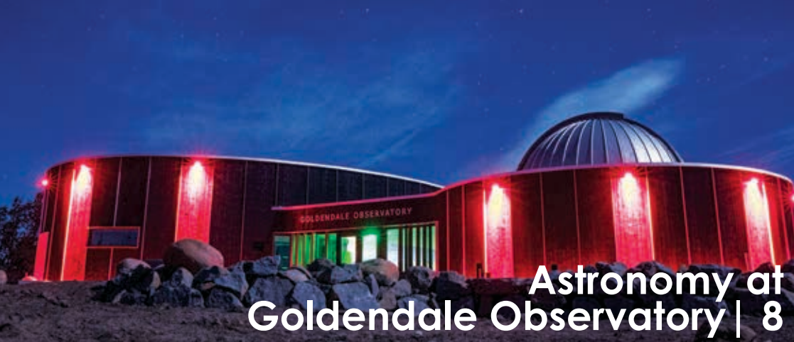
Astronomy at Goldendale Observatory | 8