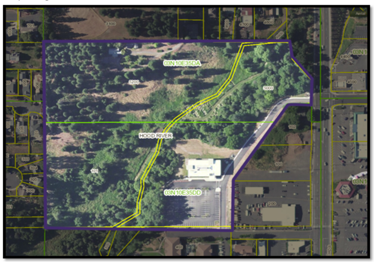
Figure 1.2 Hood River Center. Crimes or incidents reported to police occurring in this location are included in the statistics for Hood River Center. Private property is shaded in gray. Please note that a public easement (Indian Creek Trail) also runs through the college property. Indian Creek Trail is maintained and administrated by Hood River County Parks and Recreation.

The Hood River Center is located at 1730 College Way on 13.5 acres, which are bisected by Indian Creek, a public waterway, and the Indian Creek Trail. This campus is a single building and parking lot.