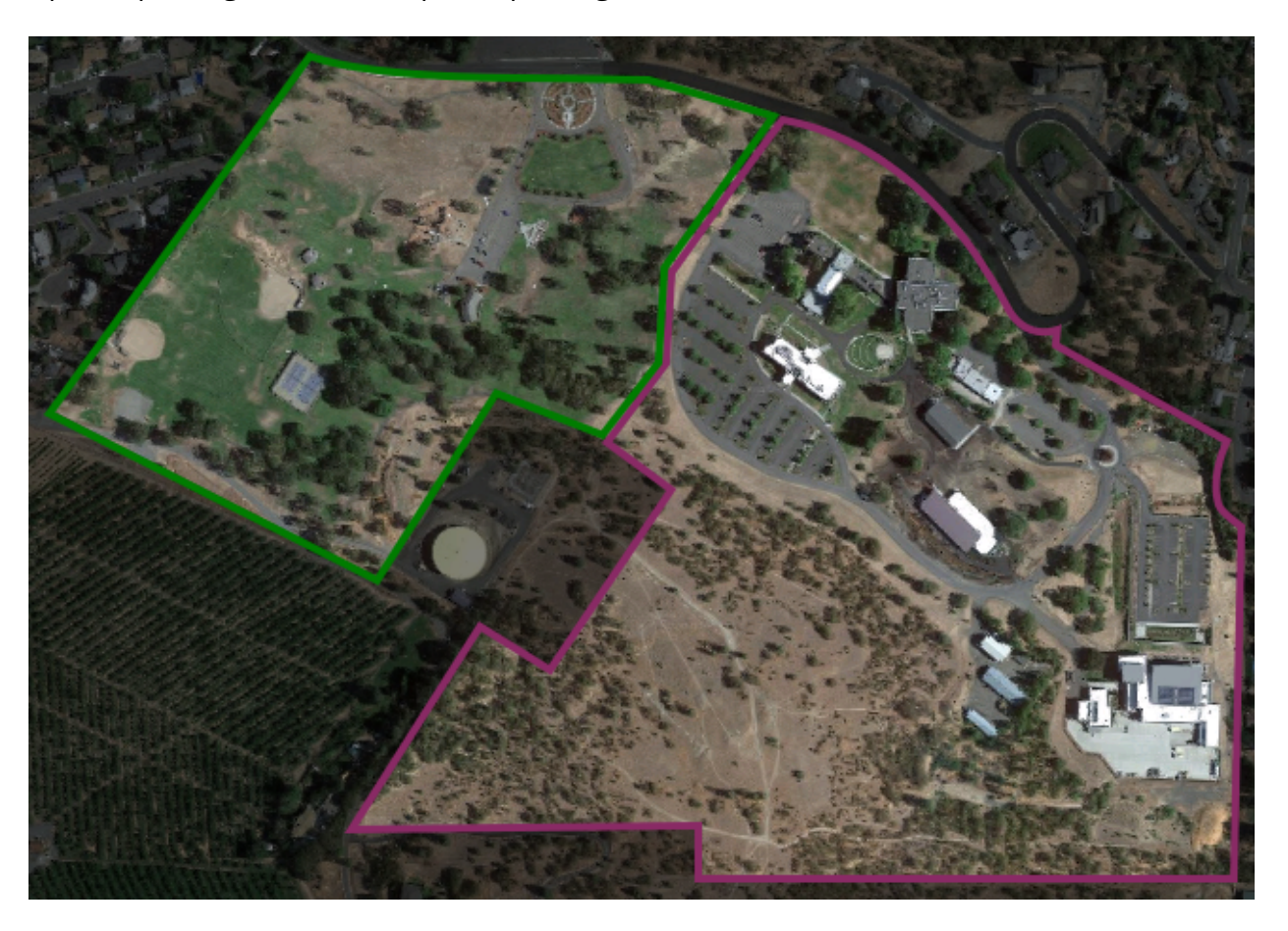
Figure 1.1 The Dalles Campus and adjacent, publicly-accessible public property. Crimes or incidents reported to police occurring in these locations, The Dalles Campus (purple border, right-hand side of the photo) and Sorosis Park (green border, left hand side of the photo) are included in the statistics for The Dalles Campus. Private property, and inaccessible/limited access public property (water reservoir and historic cemetery) are shaded in gray.

The Dalles Campus of Columbia Gorge Community College is located at 400 East Scenic Drive, The Dalles, Oregon, on approximately 62 acres. The campus abuts Sorosis Park, a 45-acre recreational park maintained and operated by Northern Wasco County Parks and Recreation. This campus includes five buildings that are maintained by the college for instructional and staff purposes, the Chinook Residence Hall, sheds and storage areas. The Fort Dalles Readiness and CGCC Workforce Center has classroom and meeting space used by the college, but is owned and maintained by the Oregon National Guard. There are also 4 paved parking lots and 1 unpaved parking area.