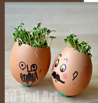
Water Cress Heads

Deje a los niños decorar las cascaras del huevo con marcadores. Rellénelo con algodón, rociar con las semillas de berro, y agregue un poco de agua. Colóquelo en un lugar soleado y vigile.