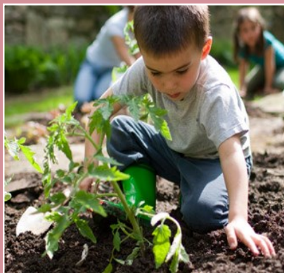
Plant a Garden

Using a fork, dip into paint and then press onto paper. Use a paintbrush for the stems.