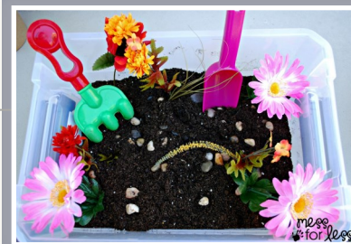
Garden Sensory Bin

No matter how big or small, just get your kids involved and have fun!