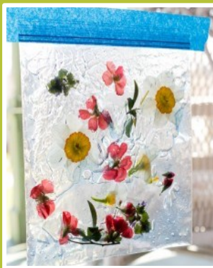
Nature Sensory Bag & Sun Catcher

Have children collect flowers and leaves and put in a clear bag with hair gel. Tape onto the window.