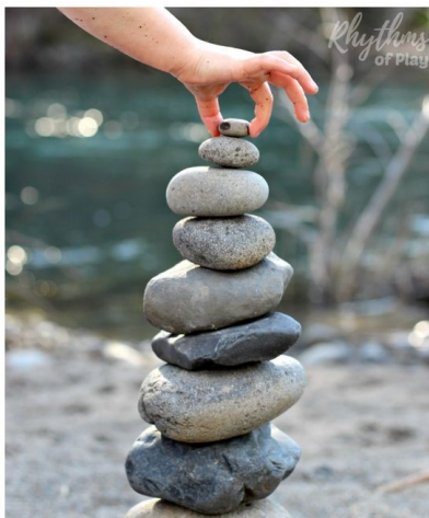
Rock Balancing Stone Stacking STEAM for Kids