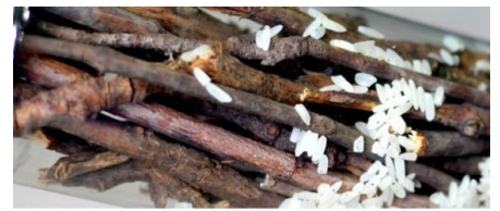
DIY Rainstick Musical Sensory Bottle