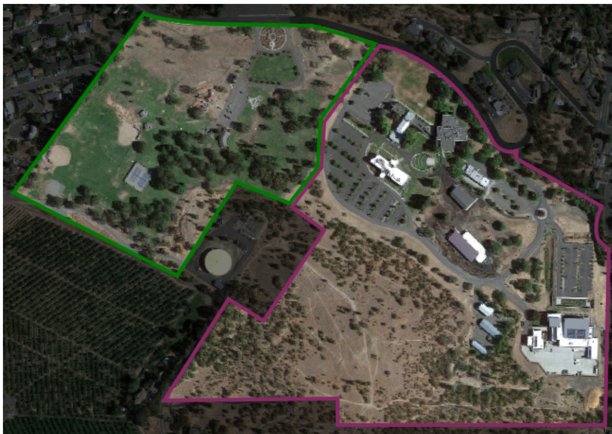
Figure 1.1 The Dalles Campus and adjacent, publicly-accessible public property. Crimes or incidents reported to police occurring in these locations, The Dalles Campus (purple border, right-hand side of the photo) and Sorosis Park (green border, left hand side of the photo) are included in the statistics for The Dalles Campus. Private property, and inaccessible/limited access public property (water reservoir and historic cemetery) are shaded in gray.

The Dalles Campus of Columbia Gorge Community College is located at 400 East Scenic Drive, The Dalles, Oregon, on approximately 62 acres. The campus abuts Sorosis Park, a 45-acre recreational park maintained and operated by Northern Wasco County Parks and Recreation. This campus includes five buildings that are maintained by the college for instructional and staff purposes, the Chinook Residence Hall, sheds and storage areas. The Fort Dalles Readiness and CGCC Workforce Center has classroom and meeting space used by the college, but is owned and maintained by the Oregon National Guard. There are also 4 paved parking lots and 1 unpaved parking area.