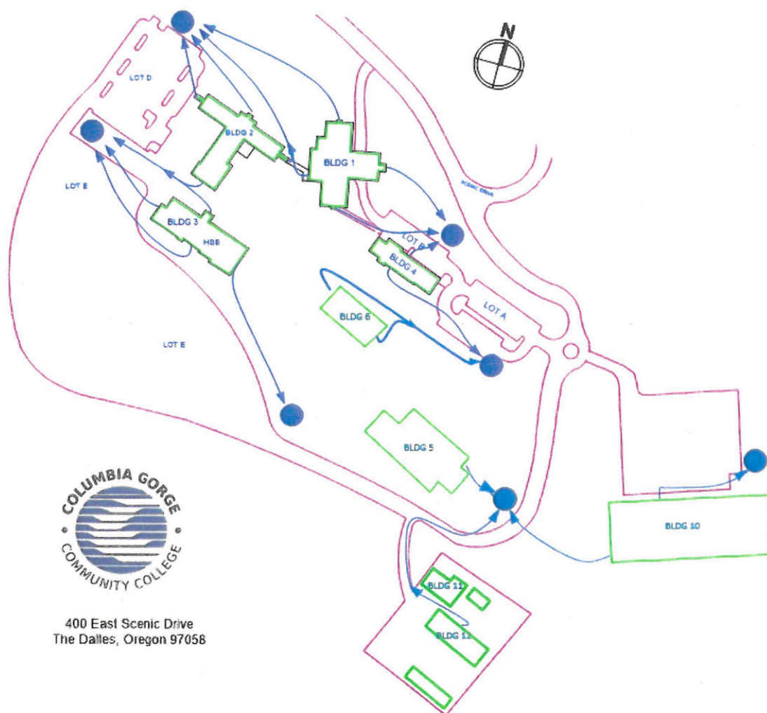
Figure 20.2a The Dalles Campus Emergency Gather Point – if a fire alarm sounds, or if you are told to evacuate due to an emergency inside the building, gather at these points for further information, and to wait for the signal that all is clear and you can return to the building.