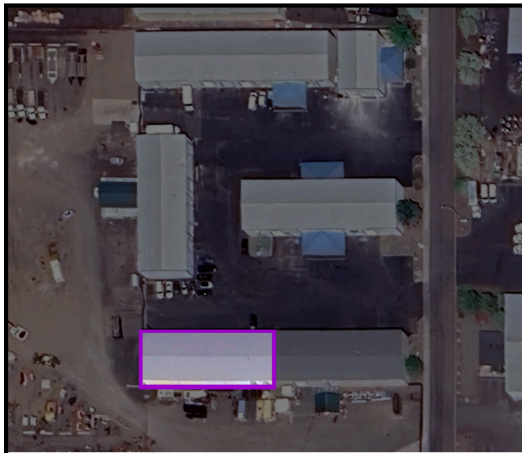
Figure 1.3 3600 Crates Way. Crimes or incidents reported to police occurring in this location are included in the statistics for Crates Way. Private property is shaded in gray.