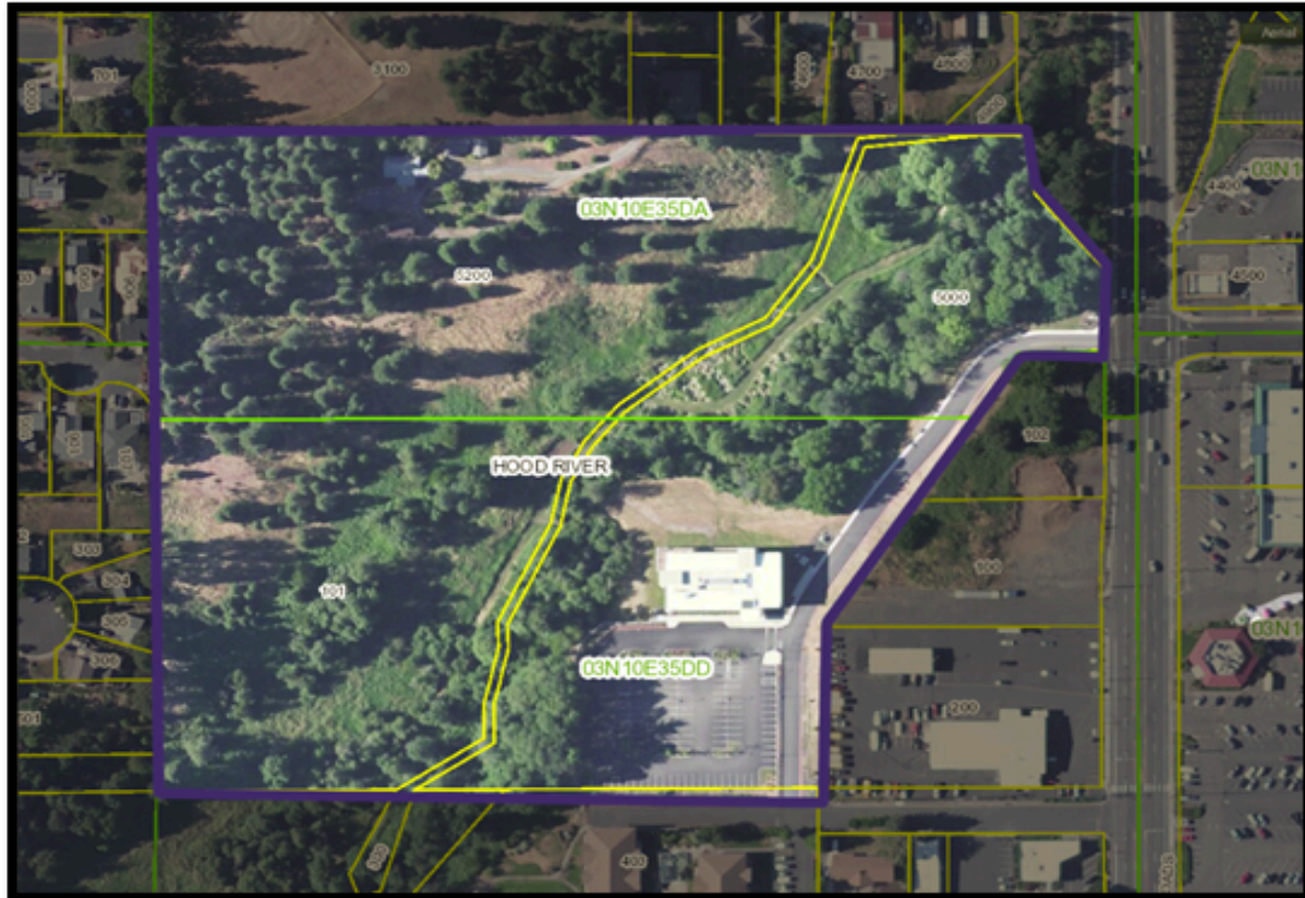
Figure 1.2 Hood River Center. Crimes or incidents reported to police occurring in this location are included in the statistics for Hood River Center. Private property is shaded in gray. Please note that a public easement (Indian Creek Trail) also runs through the college property. Indian Creek Trail is maintained and administrated by Hood River County Parks and Recreation.

The Hood River Center is located at 1730 College Way on 13.5 acres, which are bisected by Indian Creek, a public waterway, and the Indian Creek Trail. This campus is a single building and parking lot.