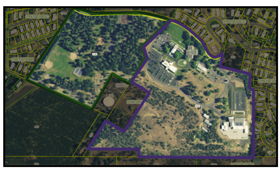
Figure 1.1 The Dalles Campus and adjacent public property. Crimes or incidents reported to police occurring in these locations, The Dalles Campus (purple border, right-hand side of the photo) and Sorosis Park (green border, left hand side of the photo) are included in the statistics for The Dalles Campus. Private property, and public property that is inaccessible (water reservoir and historic cemetery) are shaded in gray.