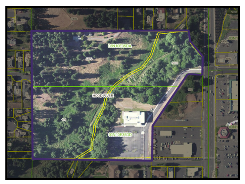
Figure 1.2 Hood River Campus. Crimes or incidents reported to police occurring in this location are included in the statistics for Hood River Campus. Private property is shaded in gray. Please note that a public easement (Indian Creek Trail) also runs through the college property. Indian Creek Trail is maintained and administrated by Hood River County Parks and Recreation.

The Hood River Campus is located at 1730 college Way on 13.5 acres which are bisected by Indian Creek, a public waterway, and the Indian Creek Trail. This campus is a single building and parking lot.