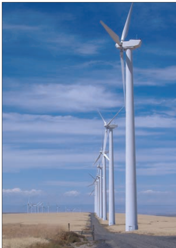
WIND FARM near Condon, part of regional fleet.

The college sponsored a High School Wind Challenge in April to encourage student interest in Science, Technology, Engineering and Math (STEM). Seven high schools brought teams of three to six students led by a faculty or volunteer mentor to the Saturday event. The faculty or mentor attended a virtual training on wind energy and provided three classroom lessons from curriculum provided by CGCC. Based on the classroom lessons, the teams used kits to construct a functioning wind turbine. Turbines were tested and judged on a variety of attributes. The competition addressed Oregon Department of Education Essential Skill requirements, and