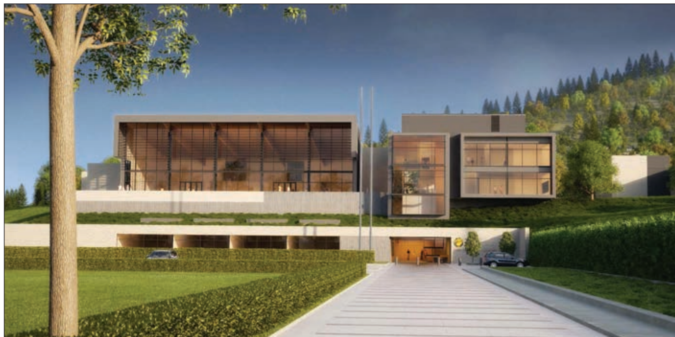
ARTIST'S RENDERING of Fort Dalles Readiness & Training Center is quickly becoming reality, with construction scheduled for late 2013.

In October 2012 the state determined that the two facilities could be combined into a single