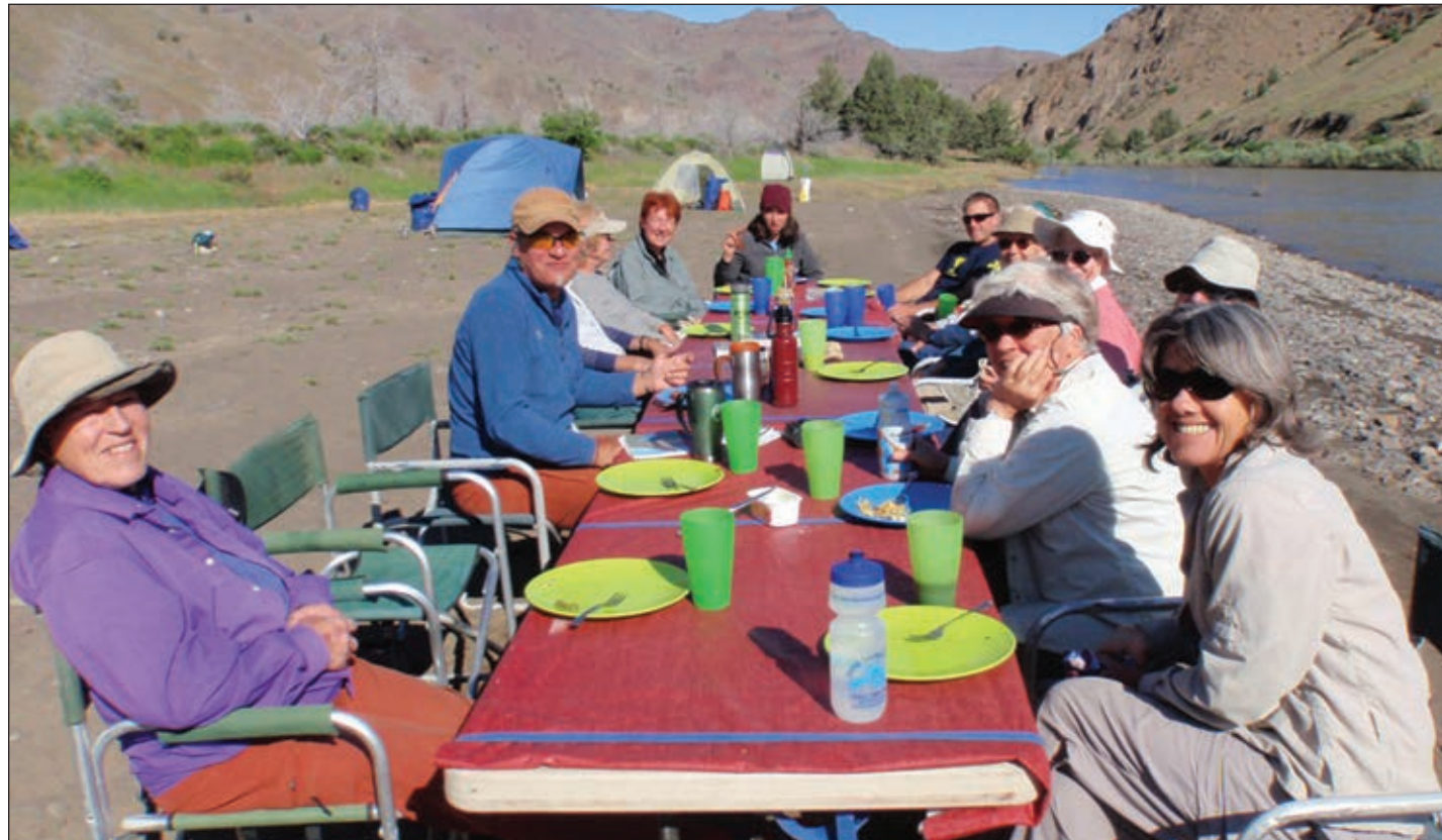
ROAD SCHOLAR participants soak up the sun on the last day of a John Day River float. During their trek they learned about topics as varied as botany and geology.

For example, the college developed a non-credit Electrical Basics Safety and Troubleshooting course for incumbent workers in the region's manufacturing and energy production industries. Many of CGCC's community education courses offer professional training; many others are taken for personal enrichment.