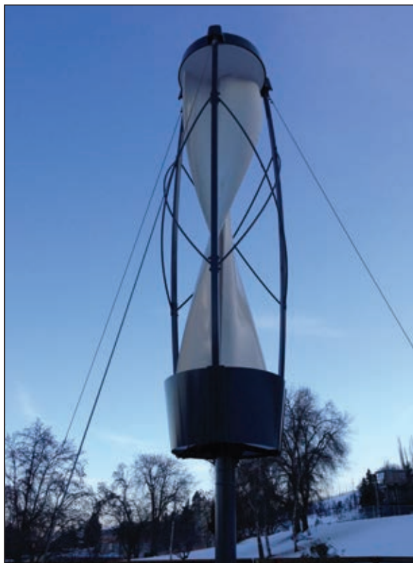
SKYRON vertical axis wind turbine, installed on The Dalles campus, generates electricity to off-set the college's carbon footprint. Skyron donated the turbine to the college, and the US Department of Energy provided funds for installation.

to maximize energy efficiency program seasonal adjustments for both campuses based on this analysis; d. Evaluate savings by reducing temperature settings on water heaters; e. Evaluate potential for heat recovery systems. • As per Green Building Policy, all new construction will incorporate sustainable principles and be energy efficient • Increase awareness and outreach to staff, students and faculty on energy use to encourage conservation and reduce usage • Consider 4-day work week during summer months (estimated energy savings of 3.5 percent) • Consider establishing a revolving loan fund from energy savings to assist in funding energy conserva-