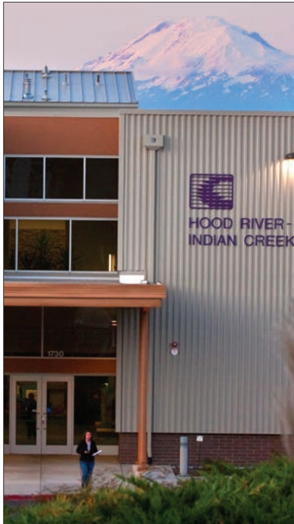
THE COLLEGE'S quest for independent accreditation is being followed closely in local communities. Above, the Hood River - Indian Creek Campus classroom building.

A registrar and institutional researcher have been hired, and the college has implemented degree