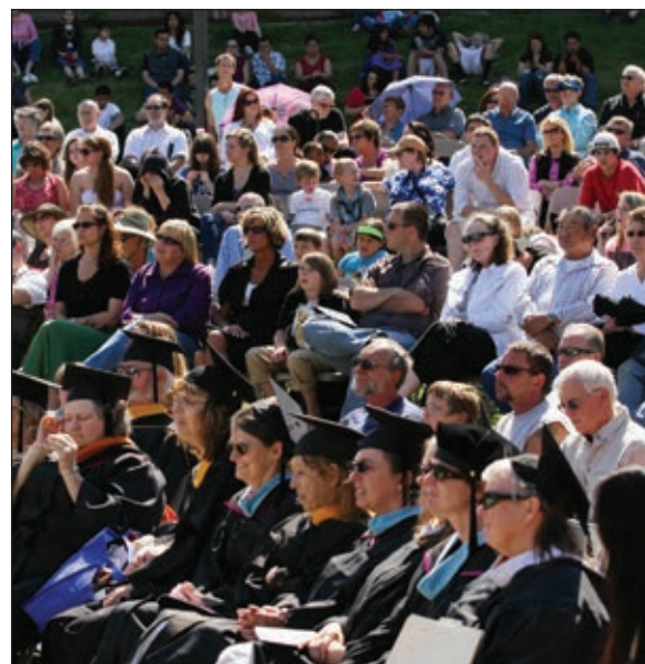
COMMENCEMENT draws families to celebrate CGCC students' achievements. CGCC foundation enables more students to achieve their dreams through scholarships.

The third grant year started Oct. 1, 2012. The